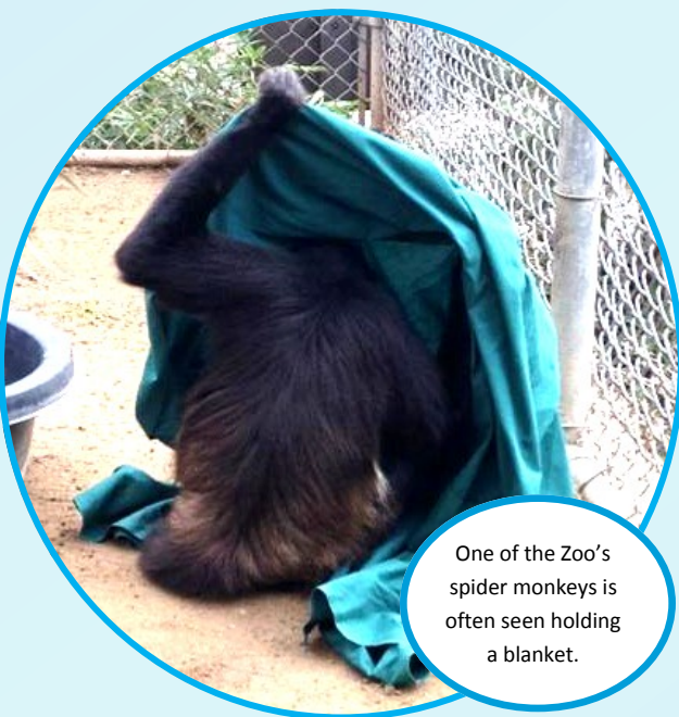
One of the Zoo's spider monkeys is often seen holding a blanket.