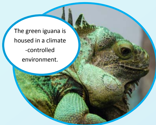
The green iguana is housed in a climate-controlled environment.