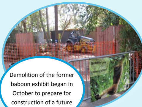
Demolition of the former baboon exhibit began in October to prepare for construction of a future gibbon exhibit.