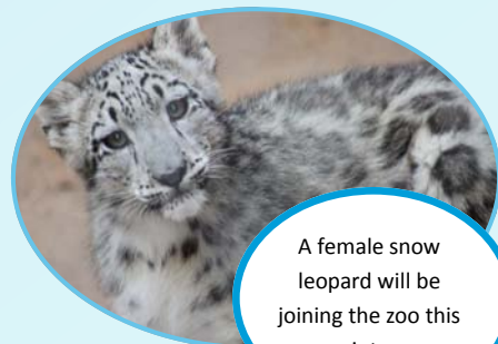
A female snow leopard will be joining the zoo this winter.

Visitors that are interested in supporting the development of these exhibits are encouraged to contact the Micke Grove Zoological Society at mgzs@mgzoo.com .