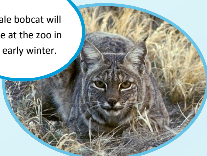
A male bobcat will arrive at the zoo in the early winter.