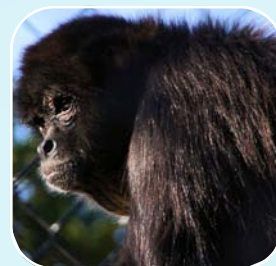
BLACK HANDED SPIDER MONKEY