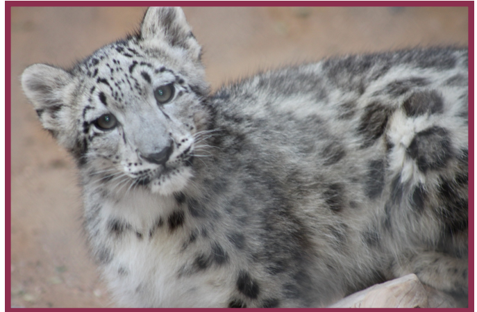
The female snow leopard cub at age 5-6 months, courtesy of the Albuquerque BioPark.

- Contributed by Zoo Curator, Avanti Mallapur