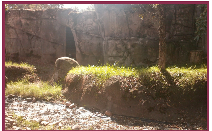
Paseo Pantera is under construction to house the new cat. The rock wall in the background contains shelves the cat can lay on.