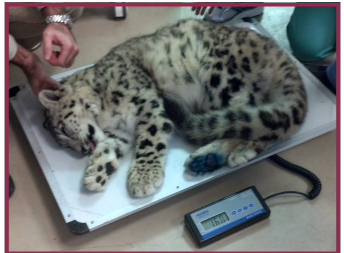
The eight month old cub being weighed for her first physical at Micke Grove Zoo. She weighed in at 16 kilograms, about 35 pounds!