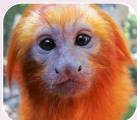
GOLDEN LION TAMARIN