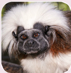
COTTON TOP TAMARIN

Give the gift of "Animal Adoption" for Valentine's Day!