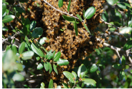
Busy as bees!

April 27th, 12 to 2PM —New Docent Orientation.