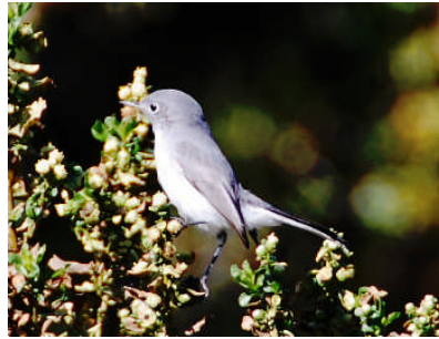
Join us, you never know what will pop up!

day of the month (see the calendar on the back page) to join us in this important work.